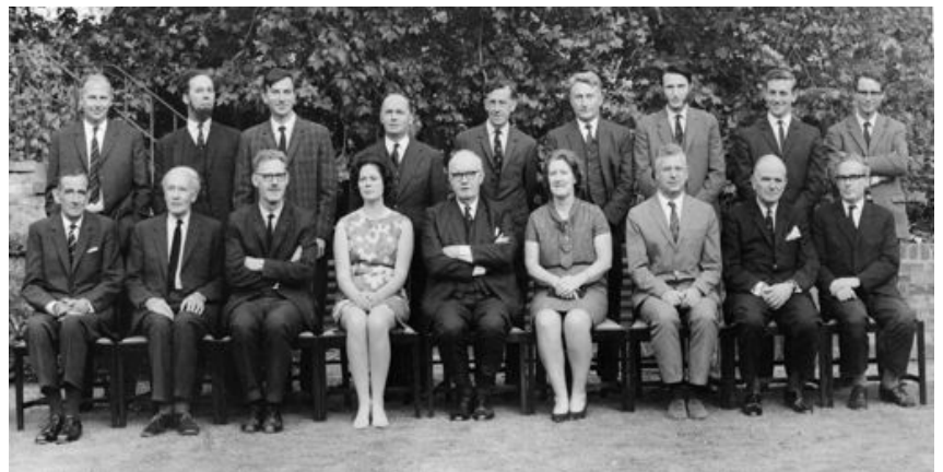
Darwin College Fellows in 1967.