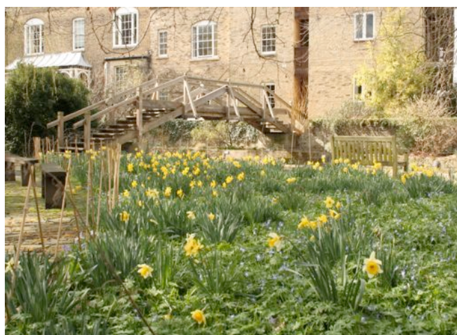
Spring flowers at Darwin College

A guided walk is planned at Hayley Wood, one of South Cambridgeshire's ancient woodlands preserved by the local Wildlife Trust. More details will be sent out in early March 2010.